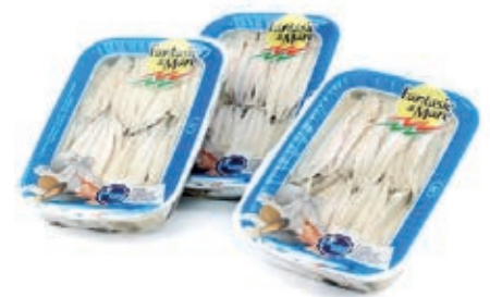
MAR630 FIL. ALICI MARINATE VASCA 200 GR.