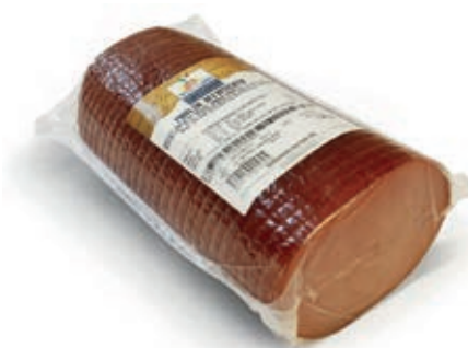
SLM200 MARLIN 120