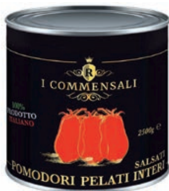
POM100 POMODORI PELATI 6X2,5 'I COMMENSALI' O.I