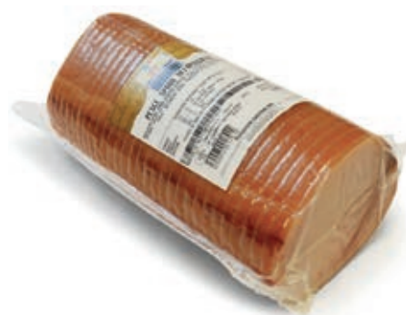
SLM300 PESCE SPADA 120