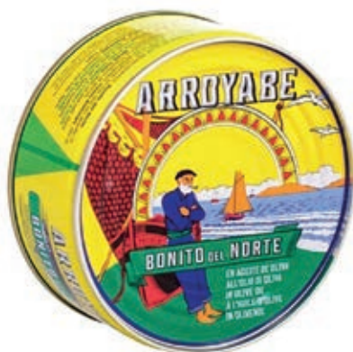
TON220 TONNO BONITO DEL NORTE O.O. GR 260 LATTA