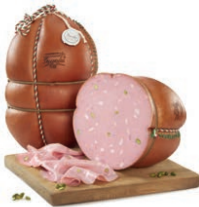
FAV200 MORTADELLA FAVOLA GRAN RISER. PIST. SV O.I