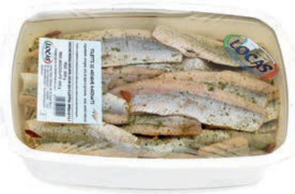
MAR900 LOCAS FIL. ARINGA MARINATA X 2