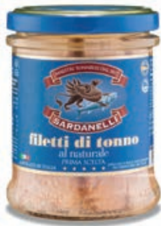
TON420 TONNO VETRO NATURALE GR 200 SARDANELLI