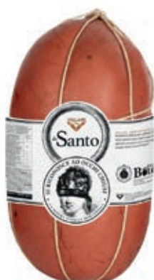
MOS700 MORTADELLA SANTO VN X 10/12 SV