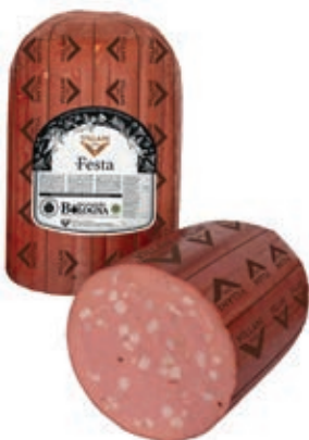
MOF210 MORTADELLA FESTA CIL X 14 1/2 PISTACCHIO