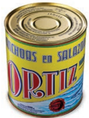
ACC600 ACC. SPAGNA KG 10 ORTIZ (9 P)