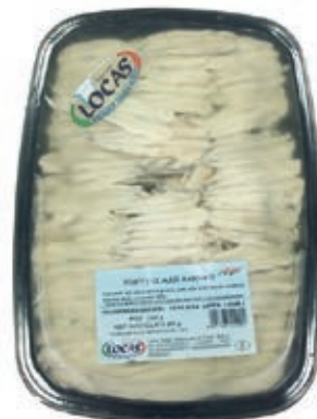
MAR620 FIL. ALICI MARINATE VASCA X 1 KG.