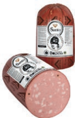
MOS610 MORTADELLA SANTO OV X 14 PIST. 1/2