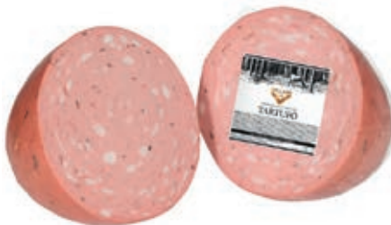
MOT200 MORTADELLA AL TARTUFO 1/2