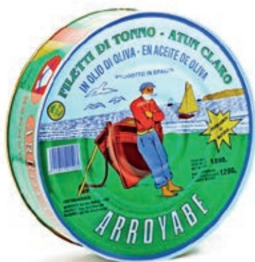
TON110 TONNO FILETTO PINNA GIALLA GR 1800