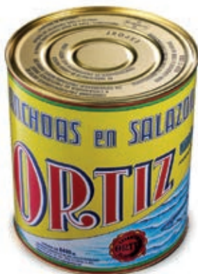
ACC605 ACC. SPAGNA KG 10 ORTIZ (10/11 P)