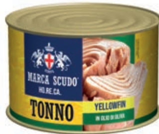
TON700 TONNO O.S. GR 1730