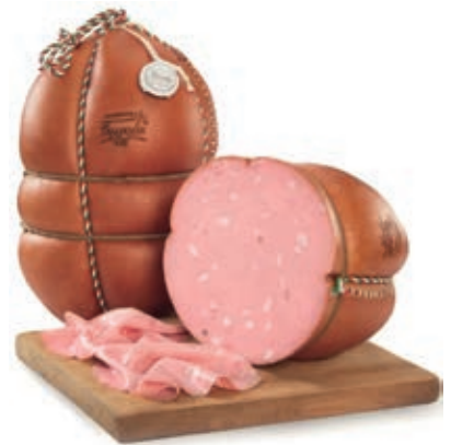
FAV100 MORTADELLA FAVOLA GRAN RISERVA O.I. SV