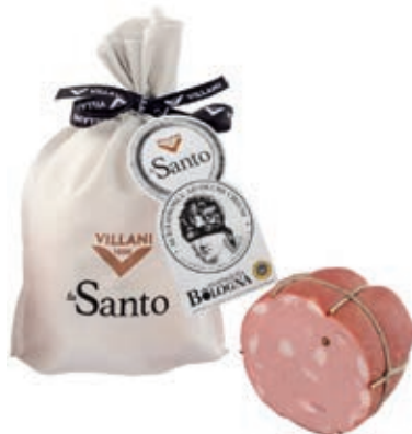
MOS910 MORTADELLA SANTO VESCICA SV X 1 A 1/2