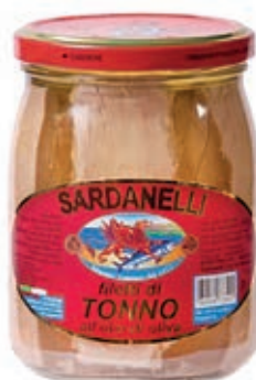
TON400 TONNO O.O GR 540 SARDANELLI VETRO