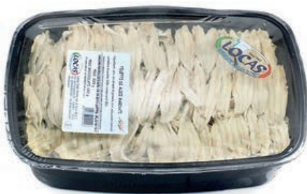
MAR610 LOCAS ALICI MARINATE X 2