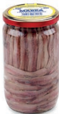
ACC210 FILETTI ACCIUGA O/S GR 700