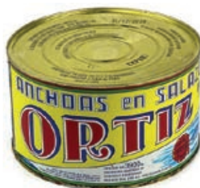
ACC715 ACC. SPAGNA KG 5 ORTIZ (9 P)