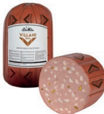
MON200 MORTADELLA NETTUNO KG 6 A 1/2