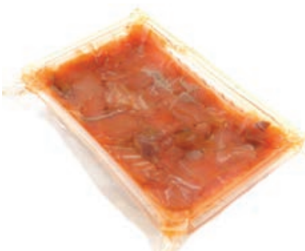
SLM520 SALMONE RITAGLI GOURMET GR 500