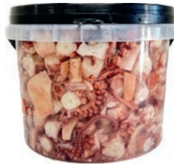
MAR400 POLPO IN SALAMOIA SEC. X 1,50 KG SGOCC.