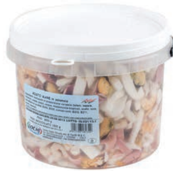
MAR120 LOCAS MISTO MARE SALAM. X 1.5 KG SGOCC.