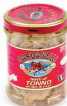
TON410 TONNO VETRO O.O. S.F. GR 190 SARDANELLI