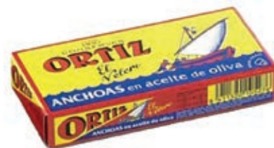
ACC140 FILETTI ACCIUGA SPAGNA O.O. GR 47,5