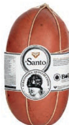
MOS710 MORTADELLA SANTO VN X 10/12 PIST