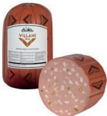
MON100 MORTADELLA NETTUNO X 14 A 1/2