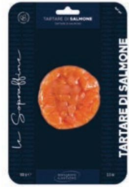
TRT840 TARTARE DI SALMONE GR 100