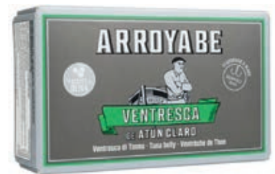
TON750 VENTRESCA YELLOWFIN GR 120 LATTA