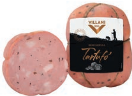
MOT100 MORTADELLA AL TARTUFO VESC. SV X 0.600