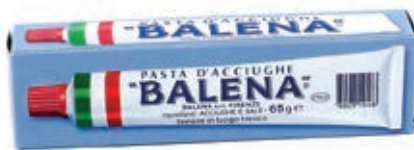
ACC800 PASTA ACCIUGHE BALENA