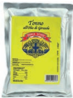
TON720 TONNO BUSTA KG 1