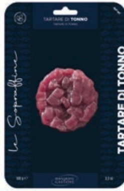
TRT820 TARTARE DI TONNO GR 100