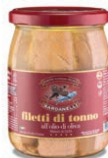
TON210 TONNO O.O. GR 620 SARDANELLI