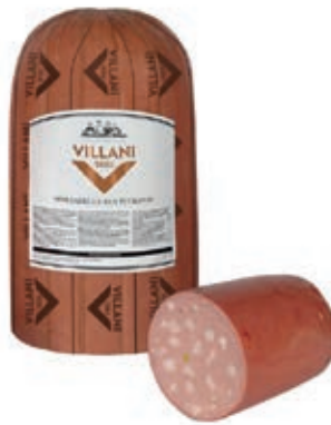
MOP200 MORTADELLA S. PETRONIO X 6 1/2 2PZ