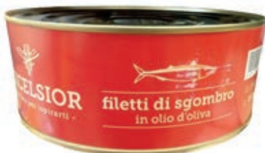
TON800 FIL. SGOMBRO OLIO OLIVA KG 2.450