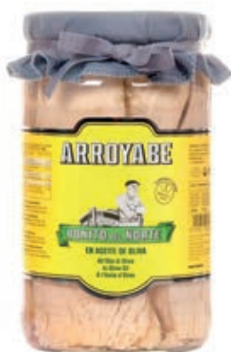
TON300 TONNO BONITO DEL NORTE O.O. KG 2 VETRO