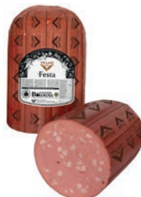
MOF100 MORTADELLA FESTA CIL X 30 A 1/2