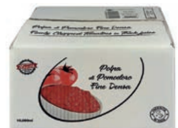
POM300 POMODORI POLPA FINE BAG IN BOX 2 X 5