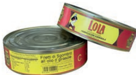
TON807 FIL. SGOMBRO OLIO DI SEMI KG 1,750