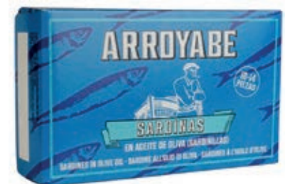
TON900 SARDINE O.O. GR 125