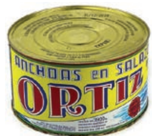
ACC720 ACC. SPAGNA KG 5 ORTIZ (11 P)