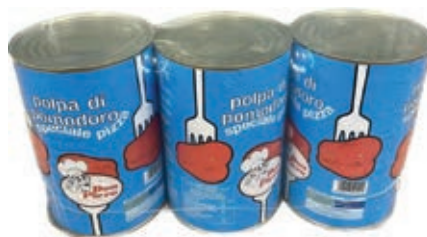
POM200 POLPA LATTA 3 X 4.05