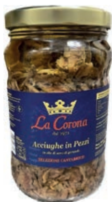
ACC150 FILETTI ACCIUGA PEZZI ML 1700