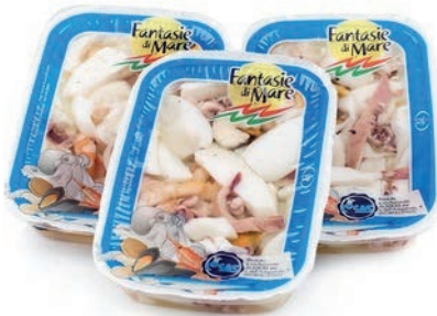
MAR300 ANTIP. MARE SENZA VERDURE VASCA 200 GR.