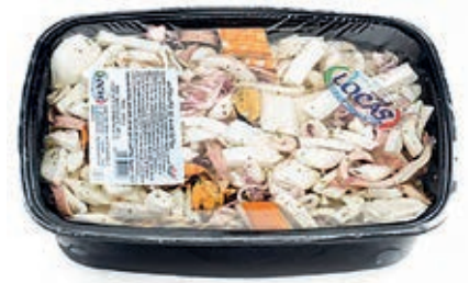
MAR200 LOCAS ANTIP.MARE VASCA X 2 KG EX