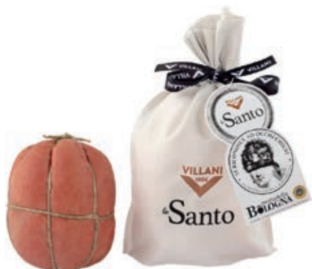
MOS900 MORTADELLA SANTO VESCICA SV X 1