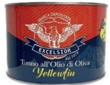
TON710 TONNO GR 1350 OLIO OLIVA