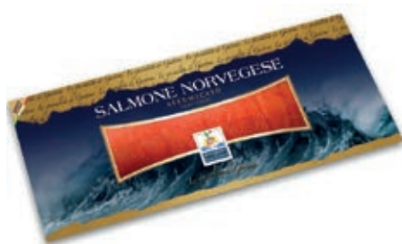
SLM500 SALMONE PREF. NORV. KG 1