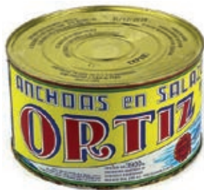
ACC730 ACC. SPAGNA KG 5 ORTIZ (14 P)