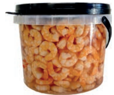
MAR500 MAZZANCOLLE SECCHI X 1,5 KG SGOCC.