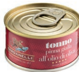
TON240 TONNO O.O. GR 80 SARDANELLI