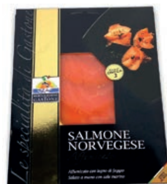
SLM540 SALMONE FETTE GR 100