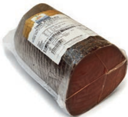
SLM100 TONNO 120