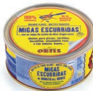
TON730 TONNO BRICIOLE BONITO NORTHE GR 670