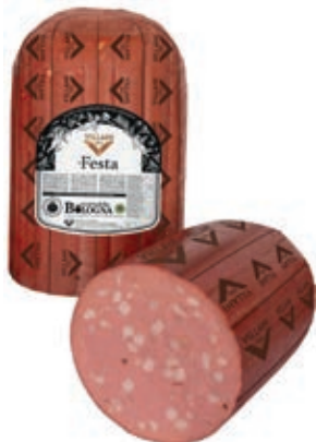
MOF200 MORTADELLA FESTA CIL X 14 A 1/2