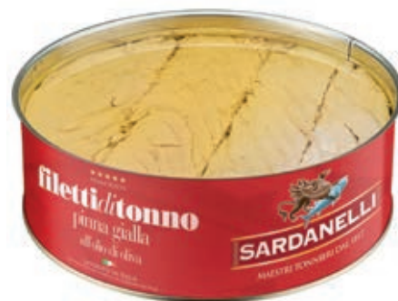
TON100 TONNO O.O. GR 2400 SARDANELLI