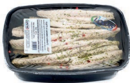
MAR800 LOCAS FIL. SGOMBRO MARINATO X 2 KG.