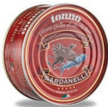
TON230 TONNO O.O. GR 160 SARDANELLI