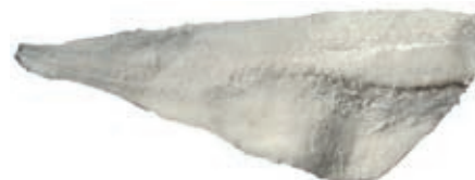
BAC200 FIL. BACCALÀ COD GADUS MORHUA 4/7 KG 5