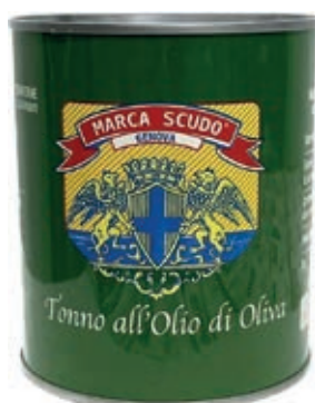
TON200 TONNO GR 800 LATTA