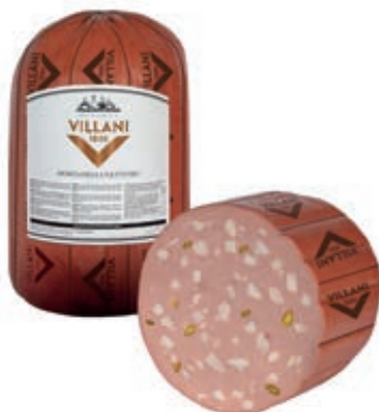
MON110 MORTADELLA NETTUNO PIST X 14 A 1/2