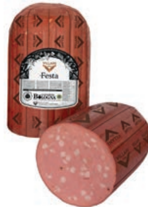
MOF220 MORTADELLA FESTA CIL X 6 1/2 PISTACCHIO